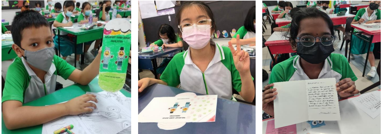
Photo: Students decorating and making envelopes and writing greeting cards.

The Muslim students have displayed resilience through fasting, and have thus spent a joyous and meaningful celebration with their families. In Concord, the students celebrated Hari Raya together with their classmates, learning about the cultures and traditions, and even took part in hands-on activities too!