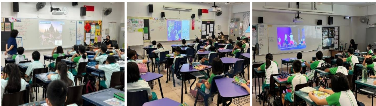
Photo: Students learning about countries in ASEAN during Assembly.

The school commemorated International Friendship Day on Monday, 11 April 2022. The theme for this year's International Friendship Day is "Singapore in Asia". International cooperation remains key in our complex world with Asia being the world's fastest-growing region; Singapore continues to facilitate closer economic, political, social, and cultural cooperation within ASEAN and in Asia. By recognising the importance of connectedness between our neighbouring countries, our younger generation can play an active role in fostering people-to-people ties, and thus celebrate the region's diversity and vibrancy and promote the spirit of friendship and collaboration.