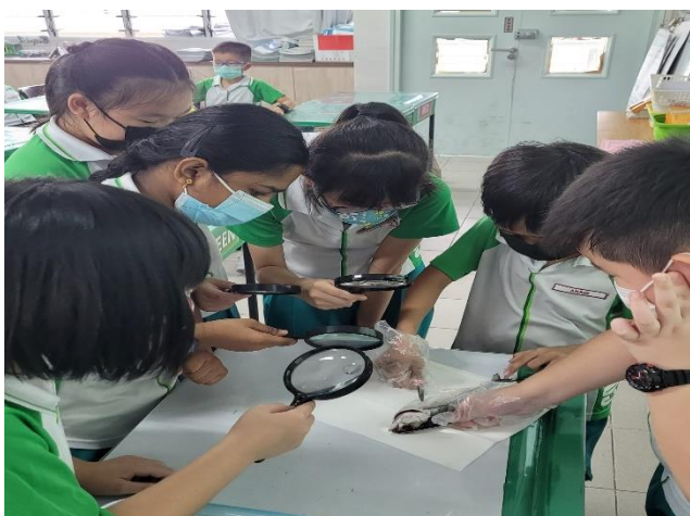
Primary 3 students learning on the topic of Animals.

Our Primary 4 students learned how to make their own ice cream! As part of their Stellar Unit in English Language, they learned on the ingredients and the steps that they need to follow in making their ice cream at home with their family. They recorded a video of them making their ice cream at home and sent it to teachers. What a hands-on gastronomic experience!