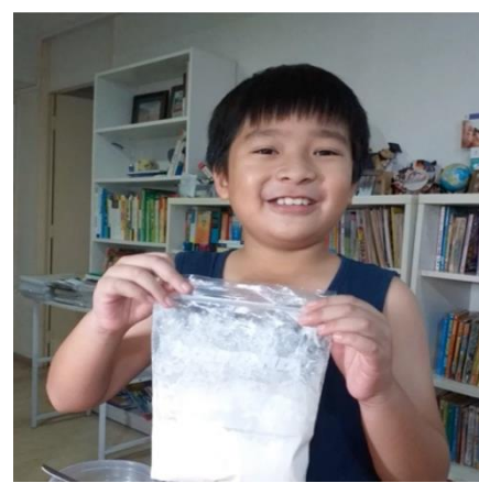
Primary 4 students learning how to make their own ice cream from English Stellar Unit.

OFFICIAL (CLOSED OFFICIAL) / SENSITIVE (NORMAL)