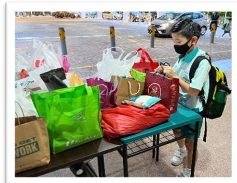
Photos: Students donating food items during the Food Donation Drive

Through these meaningful experiences, we hope to motivate and encourage positivity in our Concordians; exemplifying Excel with Care in both their thoughts and actions. At the home front, we hope parents could reinforce on your child's good behaviour and actions; and continue to get them to share their learning experiences with you.