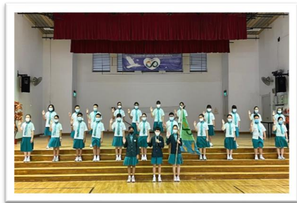
Photos: Our Primary 3 and Primary 4 Prefects taking their prefect oath during Prefects' Investiture