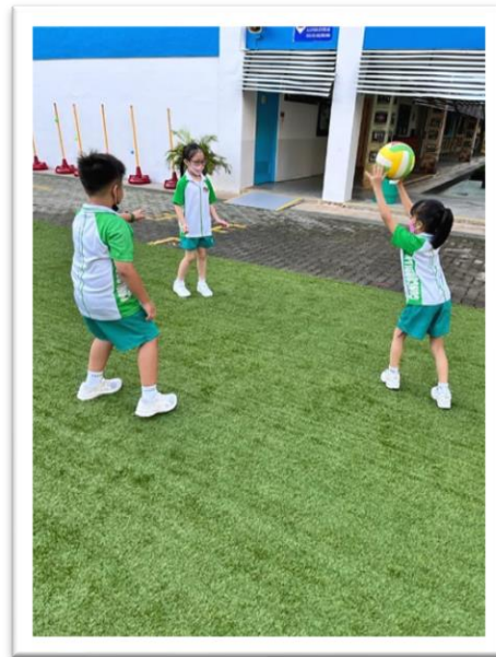
Students playing during Unstructured Play

OFFICIAL (CLOSED OFFICIAL) / SENSITIVE (NORMAL)