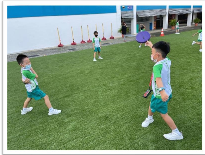
Students playing during Unstructured Play

Recently, the Primary Two students read the STELLAR big book – A Butterfly is Born. Students were fascinated observing-by the gradual growth of the caterpillar to its pupa stage and eventually to a full-grown butterfly. Their involvement in the growth of the caterpillars sparked much discussion and learning.