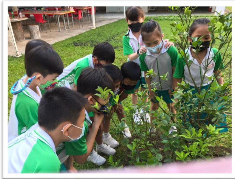
Students looking for caterpillars in the school garden

These interesting lessons and experiences ignite the joy of learning for the students! We look forward to conduct more of such interactive lessons regularly.