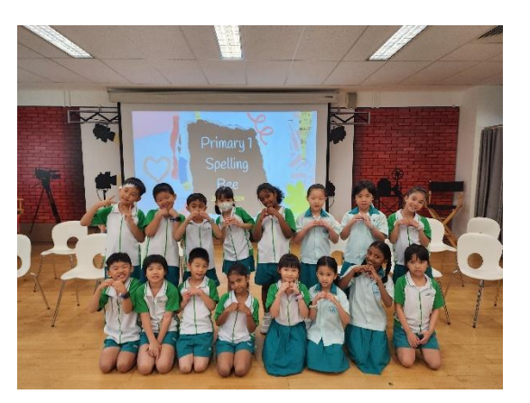
Primary 1 Participants