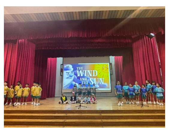
The Wind and The Sun performed by 2E