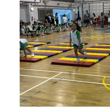
Students participating in the Sports Day.