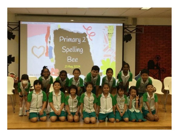
Primary 2 Participants