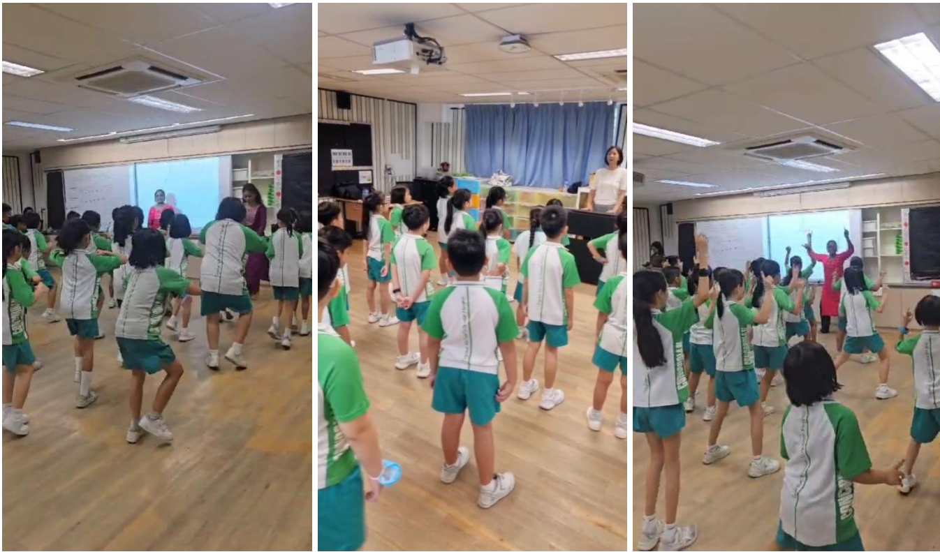
Students trying out Aesthetics Niche CCA - Indian Dance, Choir and International Dance.