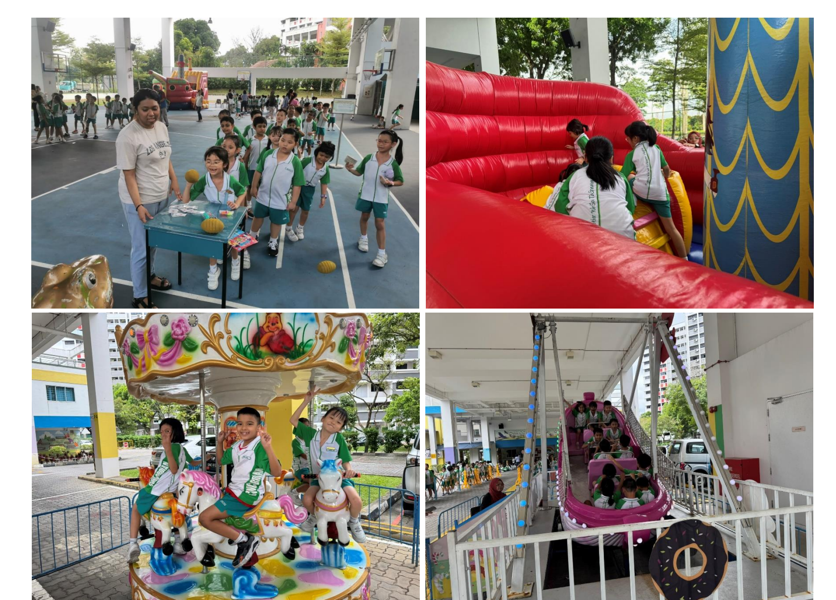
Students enjoying the various carnival games and rides.

The carnival was a day dedicated to pure enjoyment, giving students a chance to relax and celebrate their childhood together. It was truly memorable, filled with laughter and delightful experiences for everyone. The students also enjoyed delicious snacks like ice cream, popcorn, and cotton candy, adding to the joy of the day.