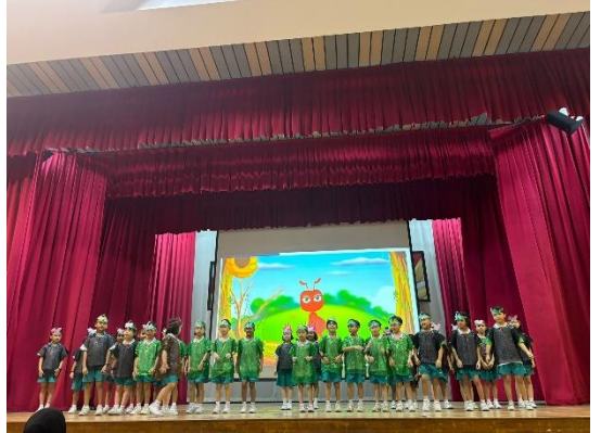
Ants in a Hurry performed by 1C