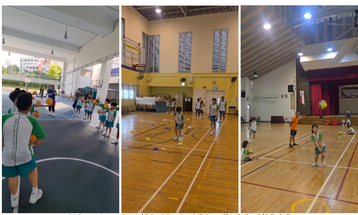
Students trying out Sports Niche CCA - Sepak Takraw, Floorball and Volleyball.

Primary 2 had their CCA Experienza on 8 October 2024. It allows students to explore and try out our Niche CCAs. The programme allowed students to explore our Niche CCAs. If the student is talent-spotted, he/she may receive an invitation to join a Niche CCA next year. For students who are not invited to join a Niche CCA, they will still enjoy a rich MCCA experience in Primary 3.