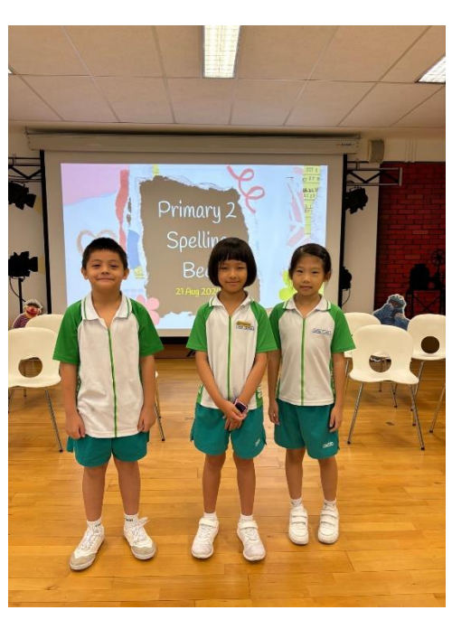
Primary 2 Spelling Bee Competition Winners