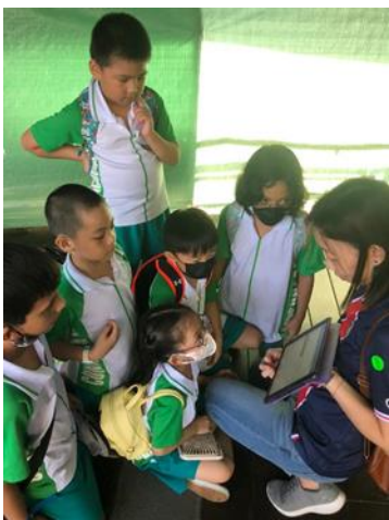
Students using the iPads to complete the customized activities with the guidance of our parent volunteer.

We are grateful for the parent volunteers who generously spent their precious time to join us on this learning journey. Their support and involvement made this experience even more special for the children.