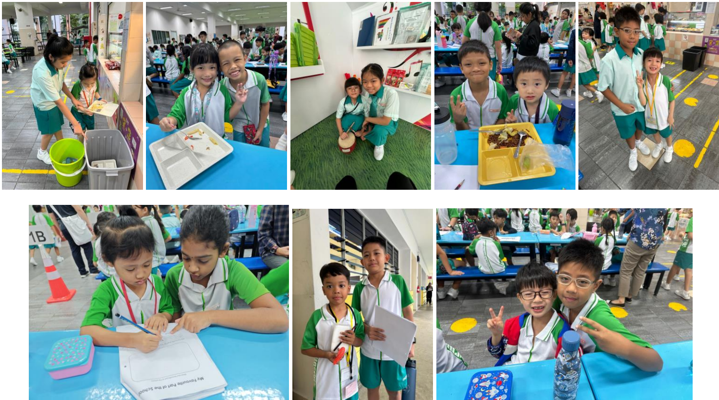
Primary 1 students with their Primary 4 buddies

Through these activities, the Primary 4 buddies played a crucial role in creating a supportive and welcoming environment for our newest students. This initiative not only helps Primary 1 students adjust to their new surroundings but also builds bonds between the students within our school community.