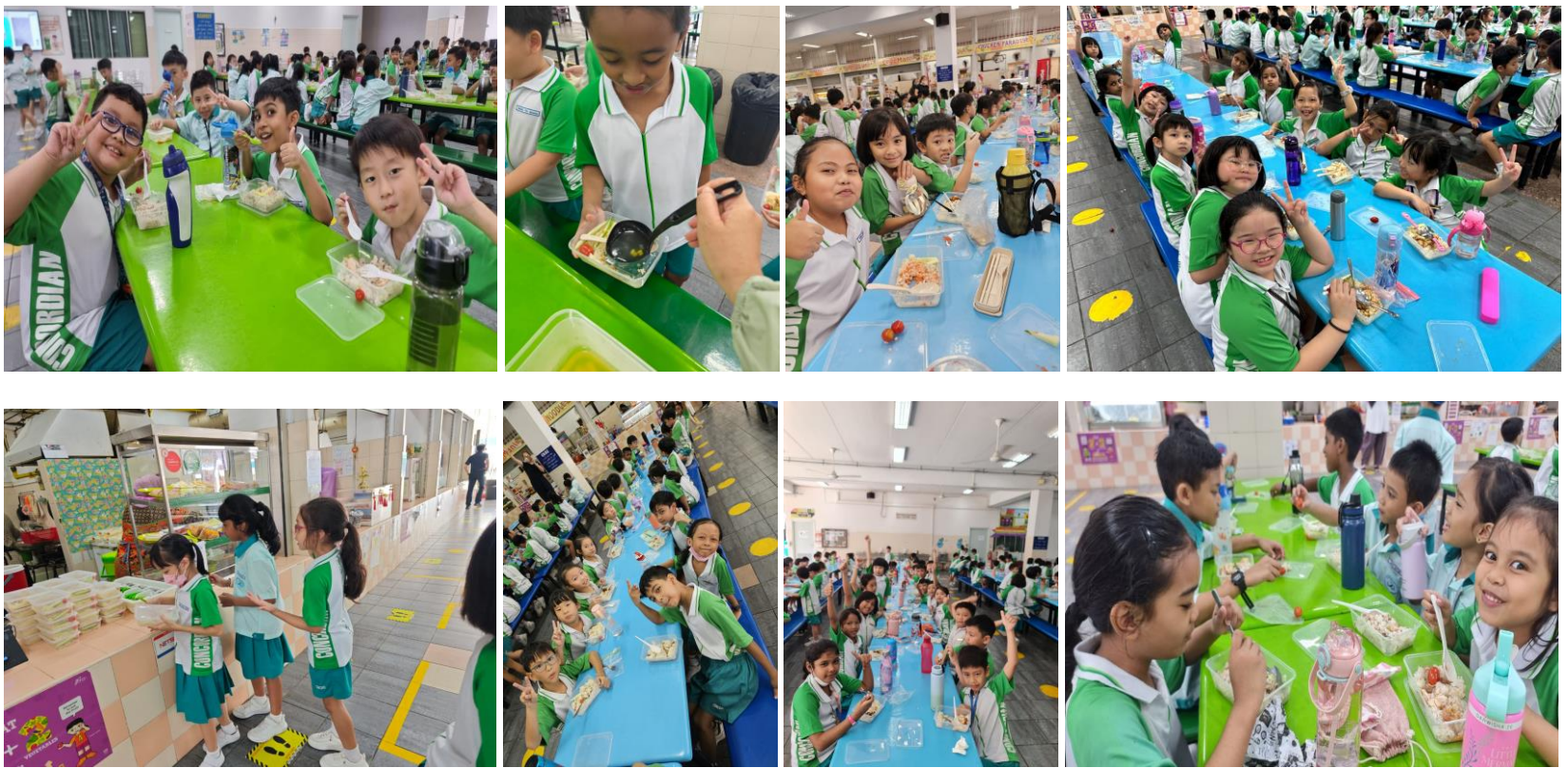
Students eating scrumptious chicken rice at the canteen.